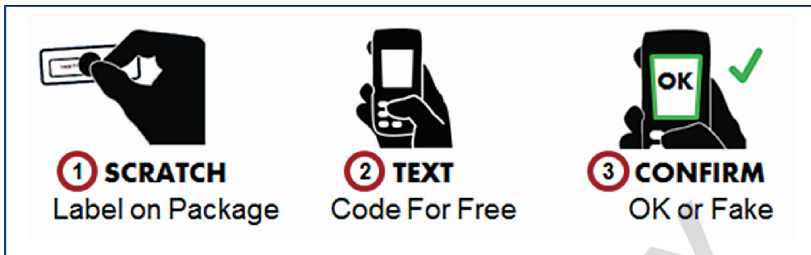
Exhibit 5 How to Use Sproxil's System